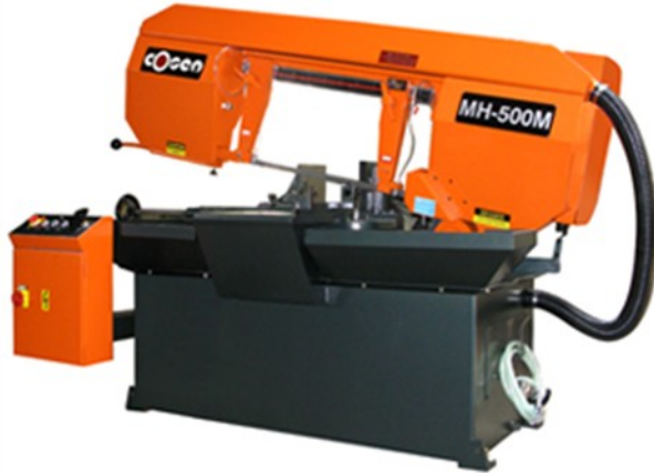
COSEN MH-500M $9750.00