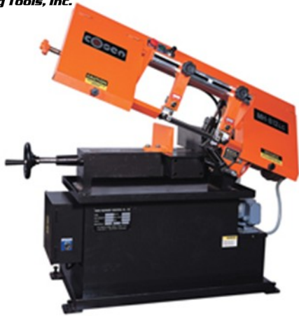
COSEN MH-812LC $3240.00