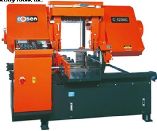
COSEN C-420NC $42,750.00