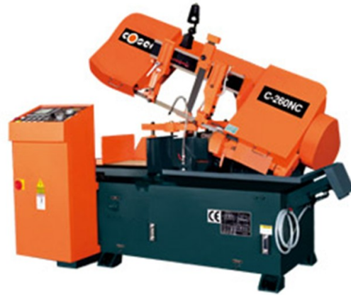
COSEN C-260NC $31,500.00