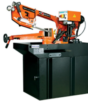
COSEN MH-270M $3240.00