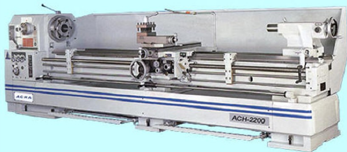
Acra ATEL2260G $33,250.00