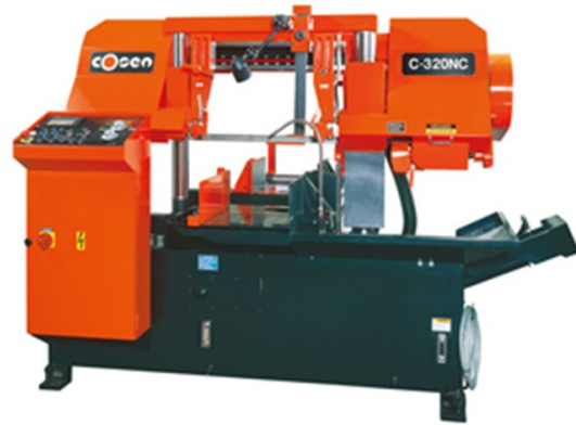
COSEN C-320NC $34,140.00